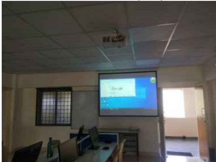
Room No: N21B ( Lab)

Latitude: 17°29'17.4" Longitude: 78°32'4.8"